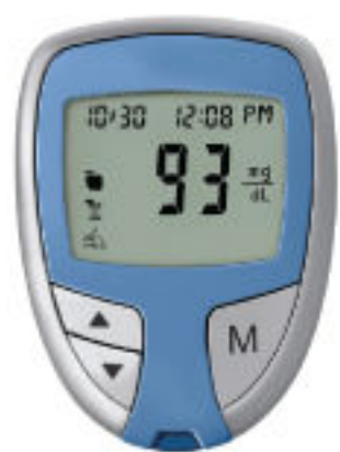
Blood Glucose Testers