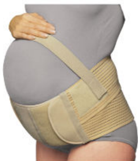
Maternity Support Belts