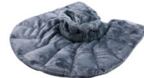
Neck Shoulder Wrap