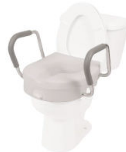
Raised Toilet Seats