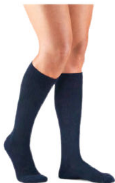
Graduated Compression Support Socks