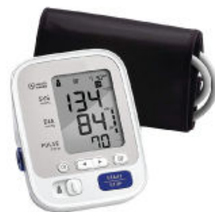
Blood Pressure Monitors