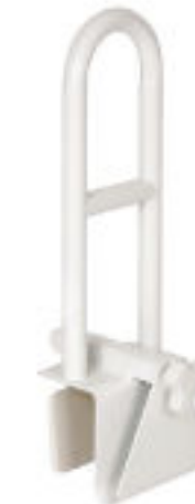
Bathtub Safety Rails