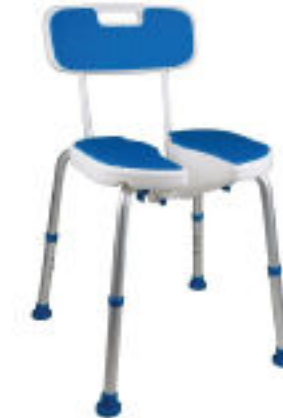
Bathroom Safety Seat