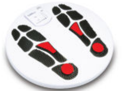
Foot Circulation Booster