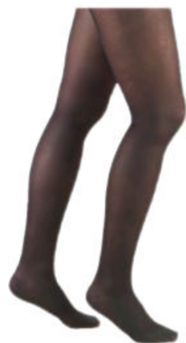
Graduated Compression Pantyhose Stockings